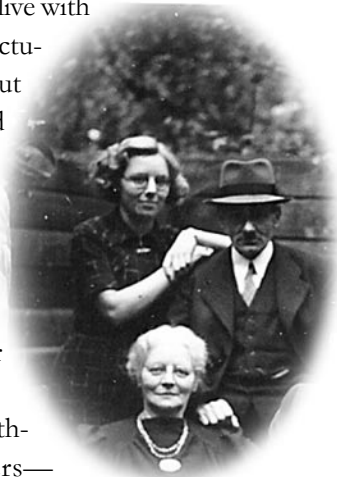
Diet and her parents

We didn't have any real bathrooms with tubs and showers—only sinks. Sometimes, in a rush, we had to wash right in the middle