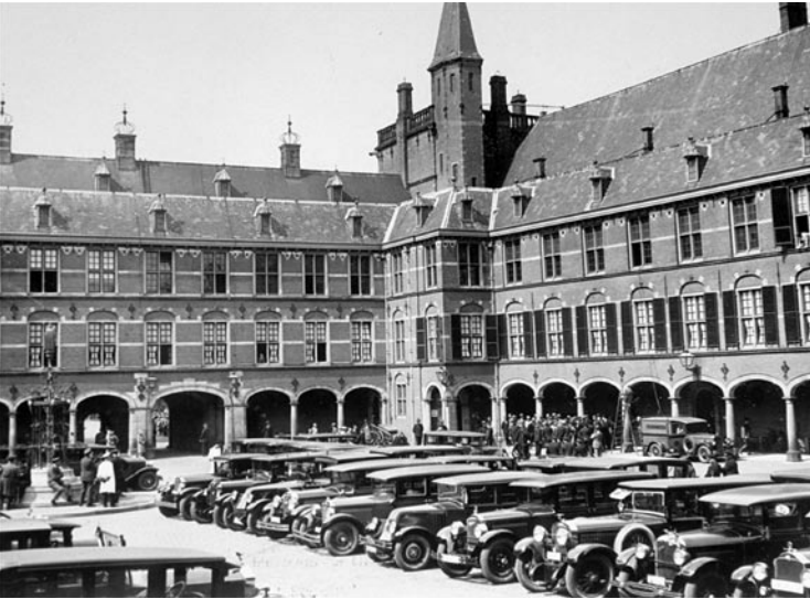
A view of the Binnenhof . Photo taken 1930-1939.